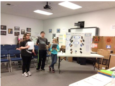
CCCS students earned third place with their project: "The Effects of Household Drinks"

Congratulations to all of the students who participated in GCC's recent Science and Engineering Fair! Some of the innovative project titles were: "GMO? OMG?", "Generator of Free Energy" and "Knuckleball Madness."