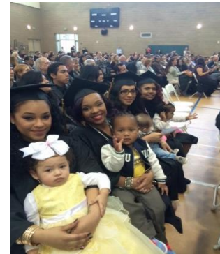
New Graduates from SAVA!